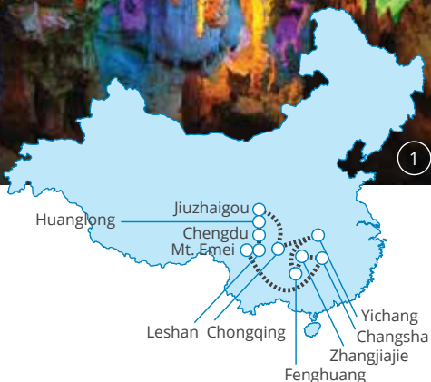
Images: 1. Yellow Dragon Cave, 2. Zhangjiajie, 3. Huanglong, 4. Research Base of Giant Panda Breeding, 5. Jiuzhaigou, 6. Mt. Emei, 7. Grand Buddha, 8. Face Changing show, 9. Tianmen Fox Fairy.