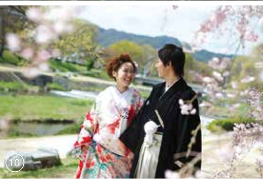
Images: 8. Toyko DisneySea, 9. Tea Ceremony, 10. Himeji Castle, 11. Kimono Photo Shoot