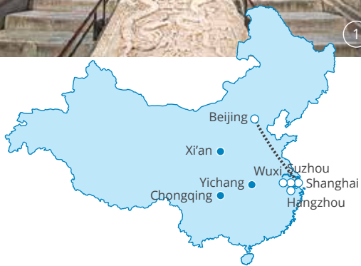
Images: 1. Temple of Heaven, 2. Forbidden City, 3. Bird's West, 4. Great Wall, 5. The Golden Mask Dynasty, 6. Summer Palace, 7. Terracotta Army, 8. West Lake, 9. Huangpu River, 10. Ancient City Wall, 11. Great Wild Goose Pagoda